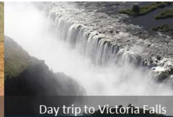
Day trip to Victoria Falls