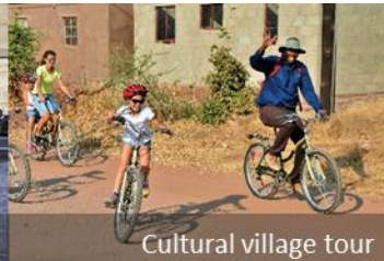
Cultural village tour